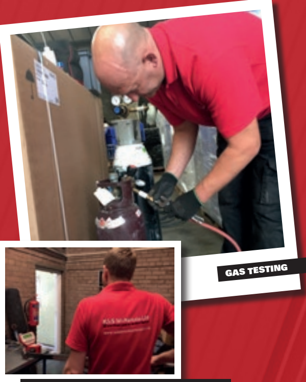
TORQUE WRENCH CALIBRATION

Our friendly Inspector will perform a thorough functionality and leak test of all components such as regulators, flash back arrestors, hoses, torches, and associated fittings. In addition, a report of their findings will be issued and the Inspector will update you on current Health and Safety and BCGA Codes of Practice which recommends that regulators and flashback arrestors are checked annually and replaced every five years.