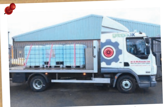
The newest addition to our fleet ready to deliver AdBlue to our customers.