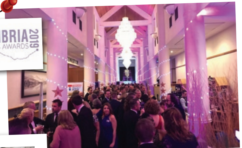
We were shortlisted in the Retailers and Wholesalers category and had a brilliant night! (Photo courtesy Carlisle Family Business Awards).