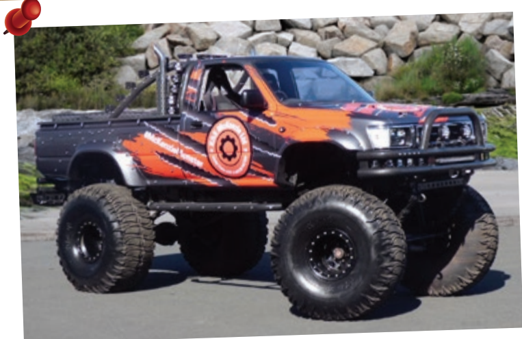
Our new monster truck hits the road! #McKenzieMonster