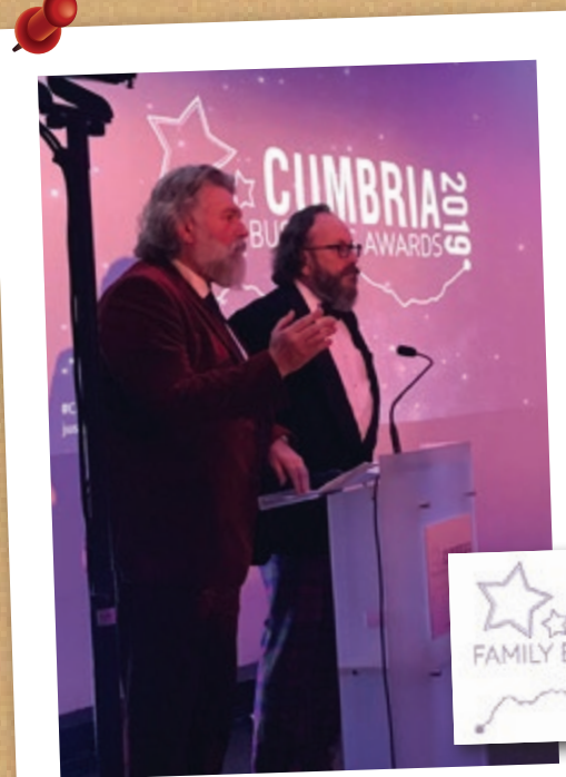
Cumbria Family Business Awards, hosted by The Hairy Bikers. (Photo courtesy Carlisle Family Business Awards).